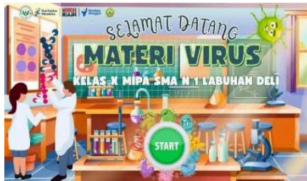
Figure 2. Initial display (home) of Canva-based interactive learning media

In terms of design, this media prioritizes attractive visuals, intuitive navigation, and the use of communicative language to facilitate students' construction of virus concepts that tend to be abstract and non-contextual. This user-oriented design approach aims to minimize cognitive barriers during both independent and classroom learning. As a visual illustration of the developed product, the home screen of this Canva-based interactive learning media is presented in detail in Figure 2.